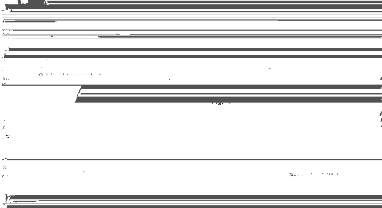
Inhibitory activity of Amphibacillus sp. 10-1