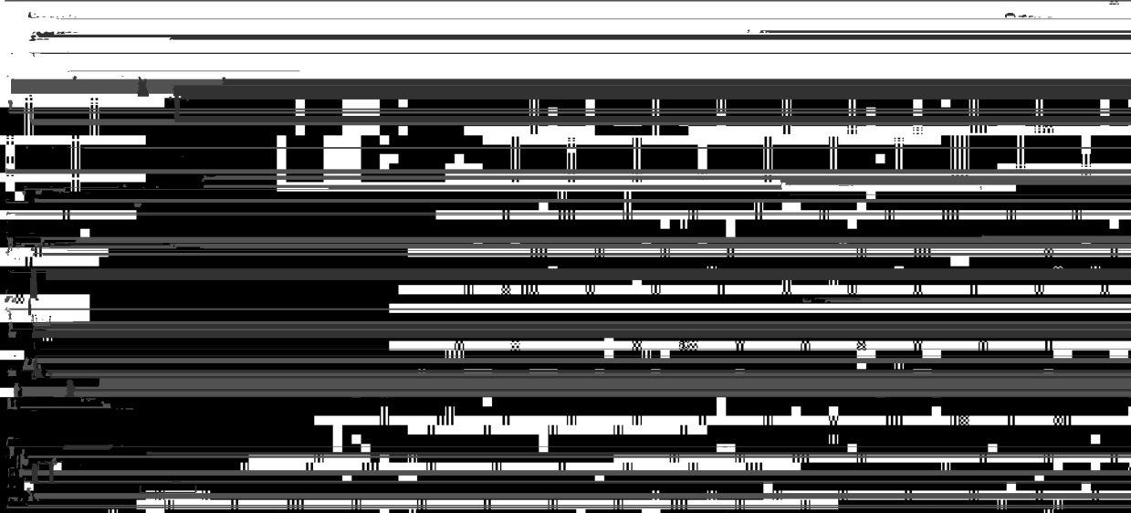
Figure 2. Chemical micrographs of (a) regular, hexagonal network, (b) oriented network and (c) heat treated