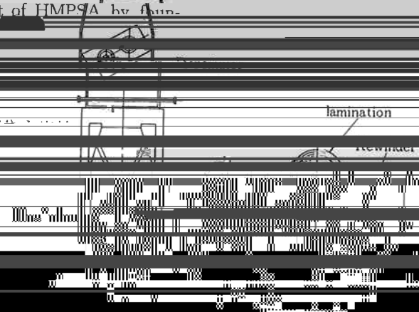
Fig. 1 Coating equipment of HMPSA by fountain