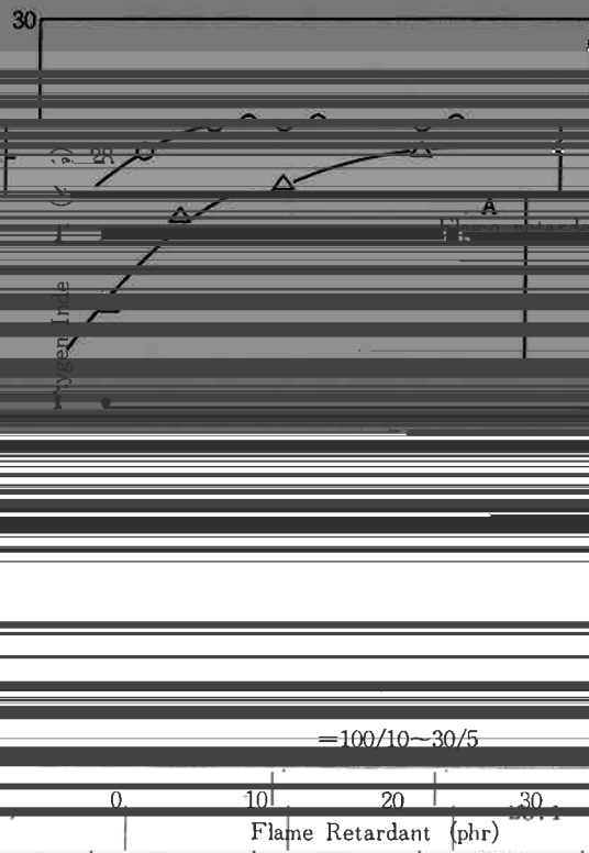
FIG. 1. Effect of flame retardants on oxygen index