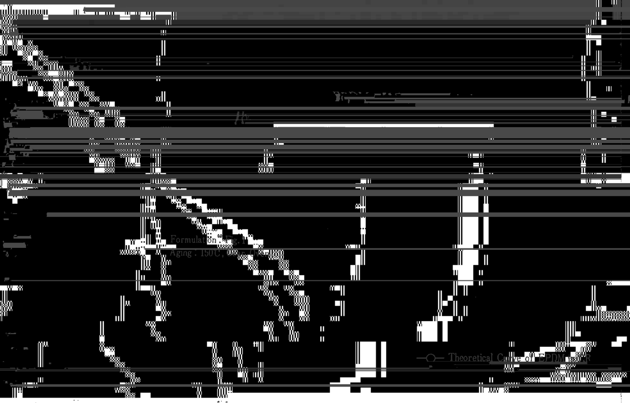
Fig. 3 Retaining of tensile strength of CR/BRDM