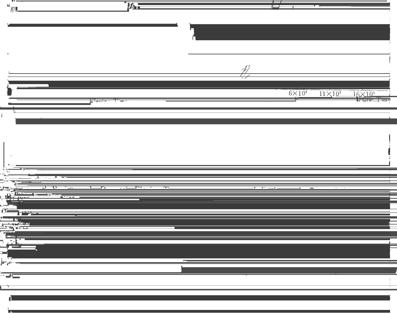
Fig. 5. Effect of Stabilizers for the Tear Growth.