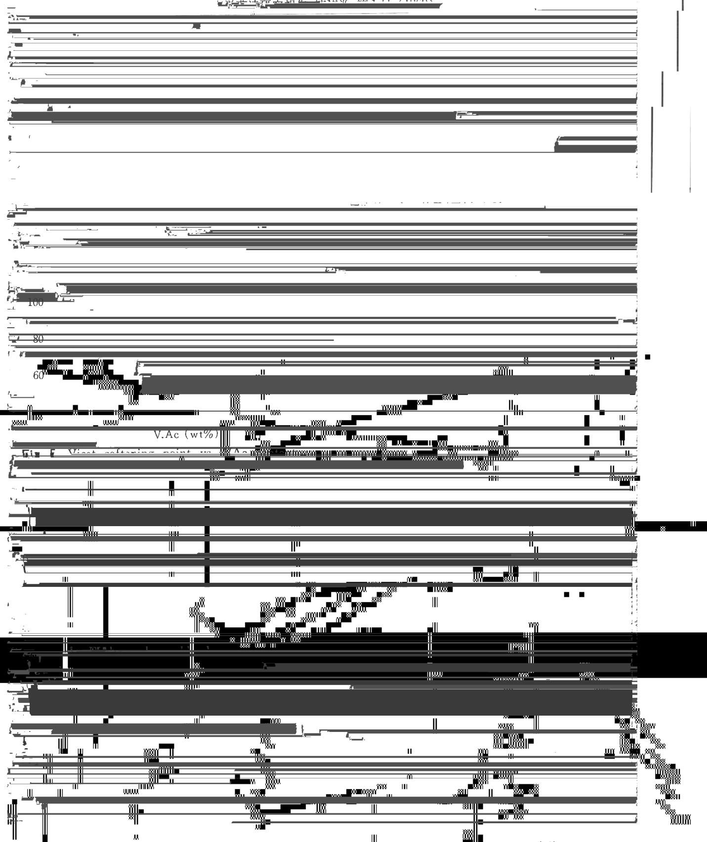
Fig. 7. Melt index vs blend ratio for P.V.A