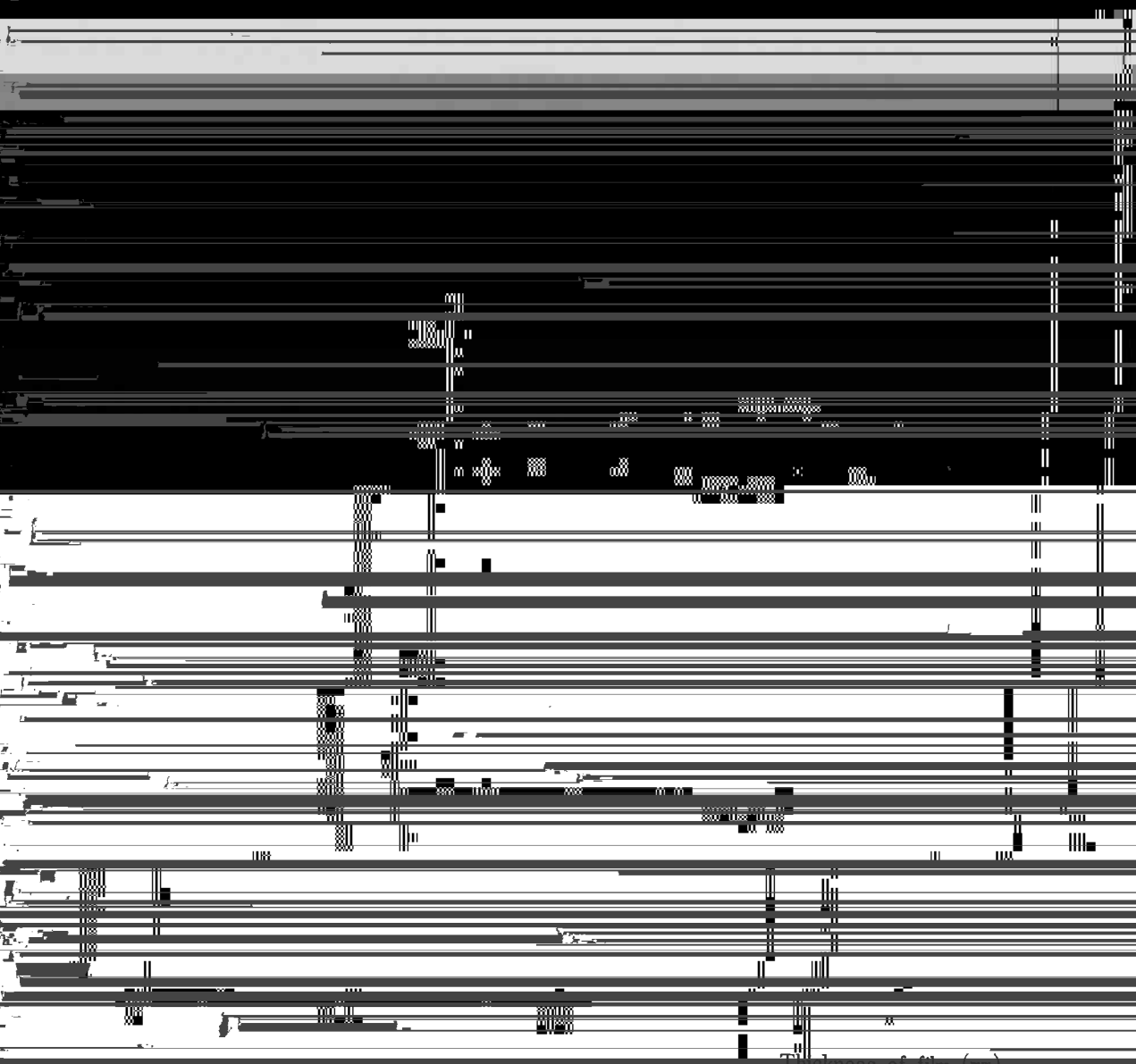
Fig. 1 Permeability through polyethylene.