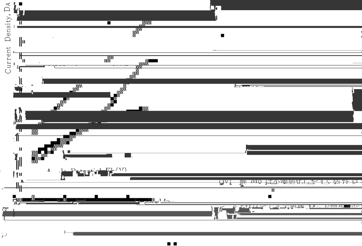
Fig. 2 Anodic polarization curves of Fe-Mo